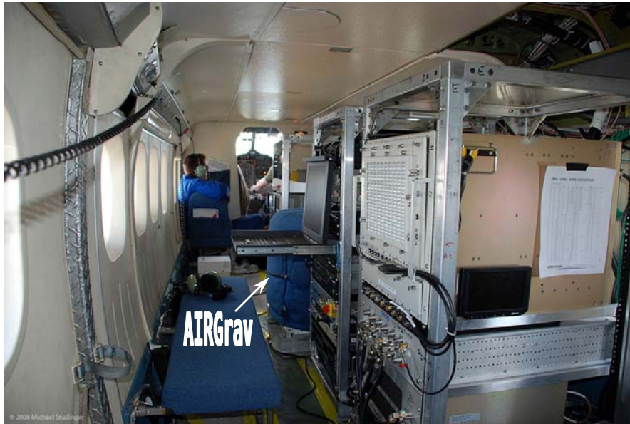
Photo of AIRGrav installed in the Kenn Borek DCH-6 Twin Otter ready for surveying.