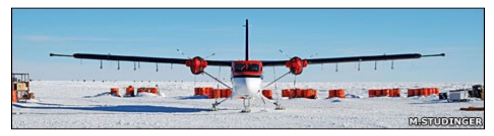
Twin Otter planes criss-crossed the Antarctic interior with their instruments

The observations come from a major expedition to survey the Gamburtsev mountain range in the polar summer of 2008-2009.